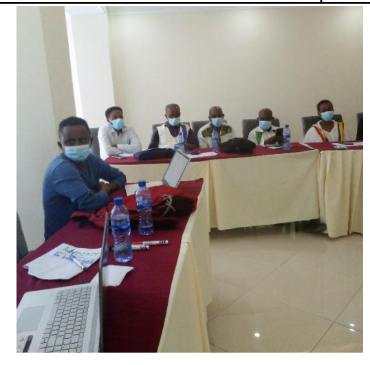
Participants attending the training