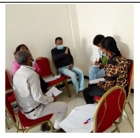
Training participants on group discussion