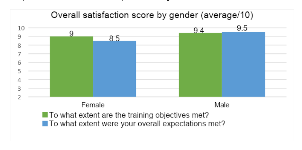
Figure 5: Overall satisfaction of participants on objectives of the training and their expectation; October 2021; Ethiopia

In terms of overall satisfaction whether or not the training had met its objectives and overall participants expectations, scores were comparable though women score lower than men on both.