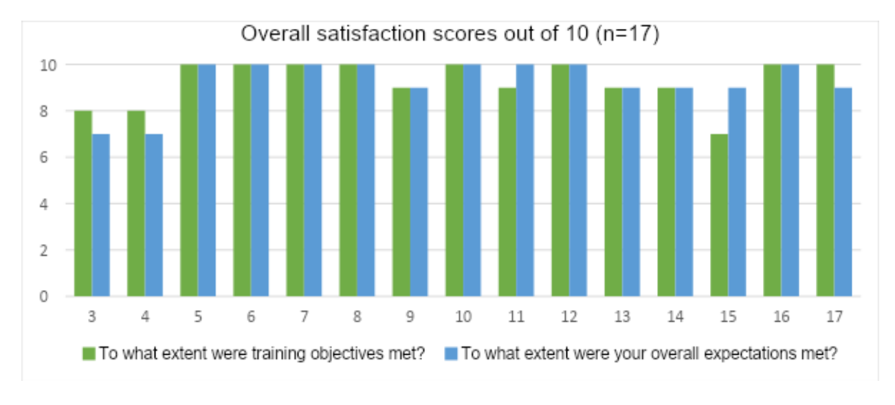
Figure 3: Overall staisfcation level of participants on training objetives and expectations; October 2021; Ethiopa

Regarding overall satisfaction of training participants on the training, seven participants reported that both the training objectives and their overall expectations were met fully (10/10). Generally, the average score (out of 10) regarding the extent to which the objectives of the training were met and for the degree to which participant expectations were met were 8.2 each. Interestingly, seven was the least score given by participants out of ten.