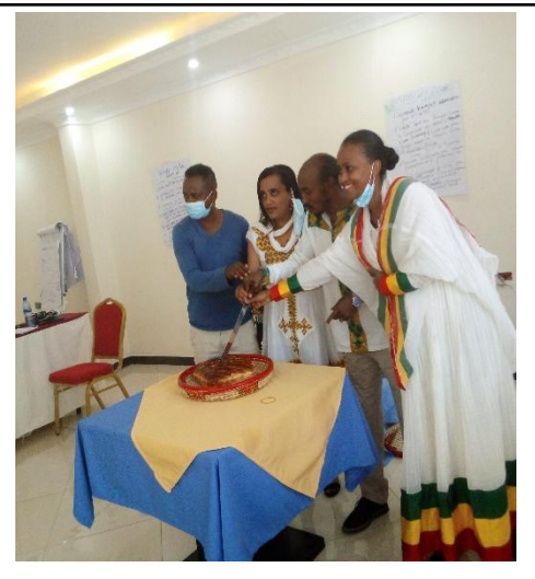
'UHC coalition-Ethiopia' leaders