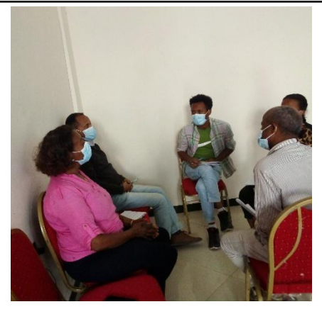
Training participants on group discussion