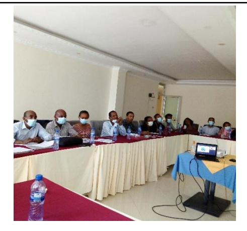
Participants attending the training