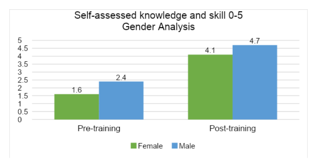
Figure 4: Gender-based analysis on self-assessed knowledge on training topics before and after training; October 2021; Ethiopia

Among the training participants, six were women. A gendered analysis showed that men rated their confidence far higher than women did at baseline (2.4 compared to 1.6 on average). By the time of the post-evaluation average scores for men and women were 4.1 and 4.7 respectively. Overall, women reported improvement of knowledge level by difference of 2.5, while that of men was 2.3 which were comparable.